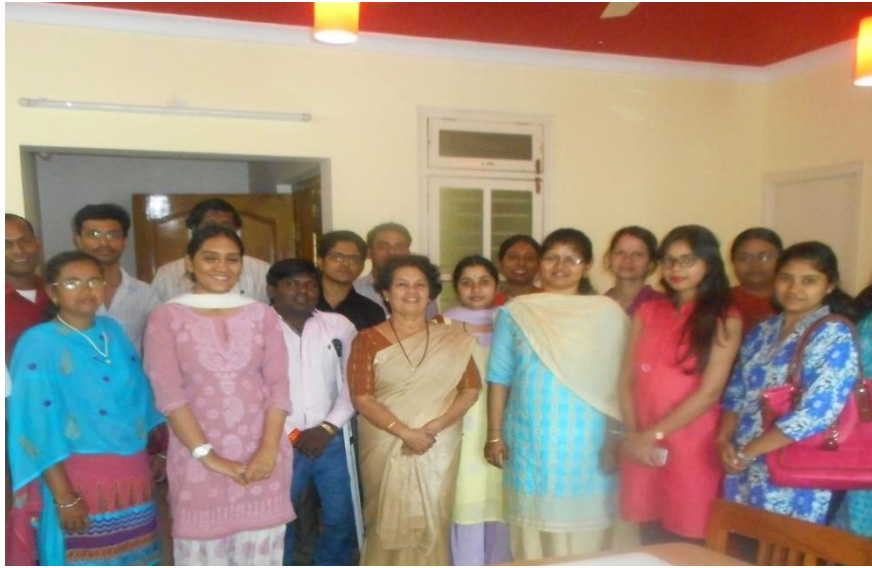
Workshop on SI, toileting and feeding for young children with ASD