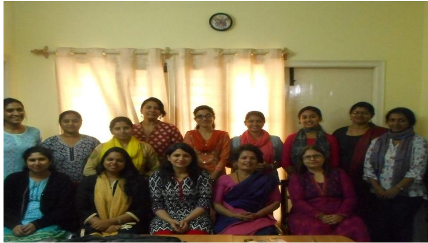
New Affiliate Teams at H.O.