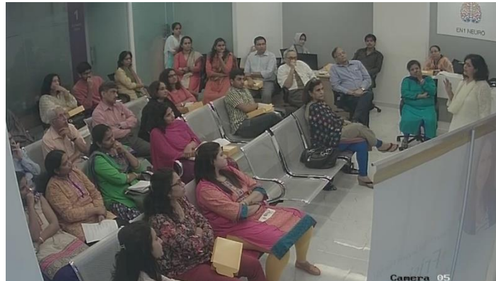
Awareness activity at Com DEALL unit at EN1, Mumbai