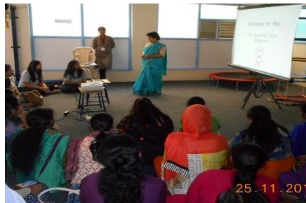
Deloitte Impact Day