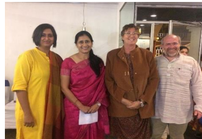
CRE on Autism at ISHA Conference

As per the advice of our auditors steps towards setting up a new company “ COMMUNICAIDS INNOVATION PRIVATE LIMITED ”, were processed.